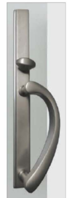
EXPRESSION SATIN NICKEL