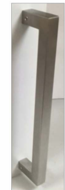
CONTEMPORARY STAINLESS STEEL